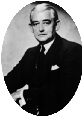
Izaak Walton Killam